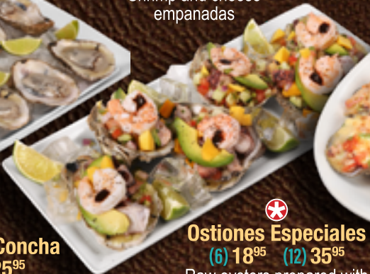
⊕ Ostiones Especiales (6) 18 95 (12) 35 95 Raw oysters prepared with pico de gallo, avocado, octopus and shrimp