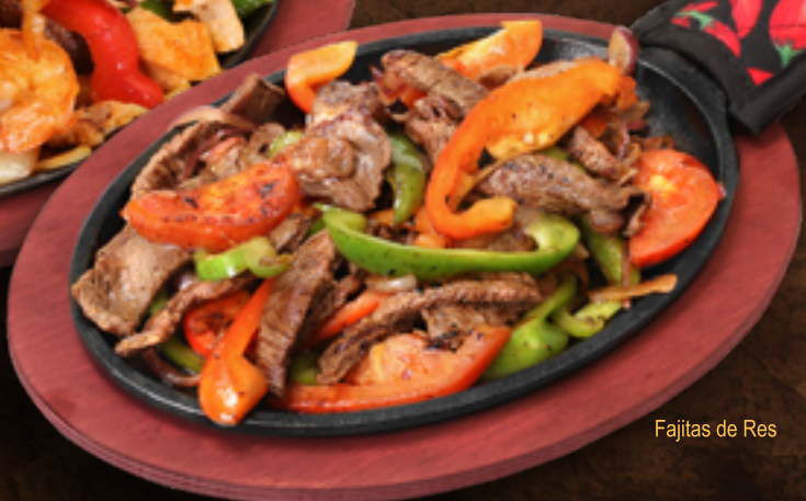
Fajitas de Res