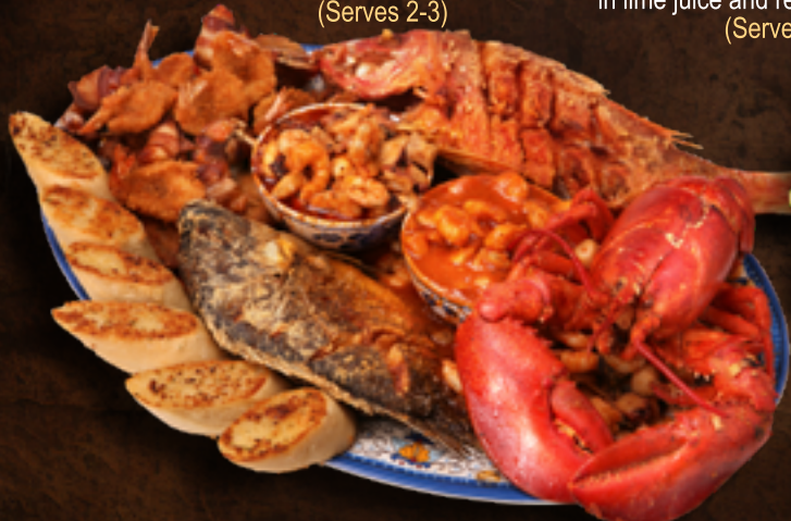
Charola Del Patrón Serves 4-6 people MP$ Whole lobster, whole red snapper, whole tilapia fish, breaded shrimp, shrimp wrapped in bacon, chapuzón, shrimp in spicy deviled sauce, rice, garlic bread, and fries