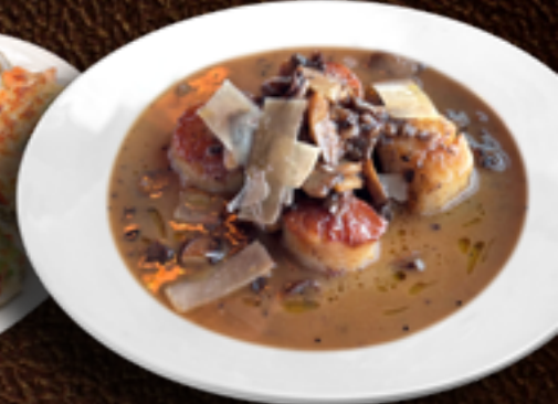
Callo de Hacha En Crema de Hongos 25 95 Scallops in mushroom cream