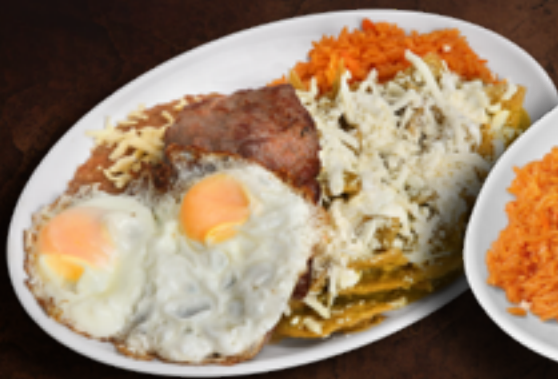
Chilaquiles Verdes Con Cecina Y Huevos