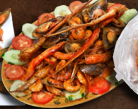
Charola Encantadora 49 95 Crab legs, shrimp, mussels, octopus and scallops