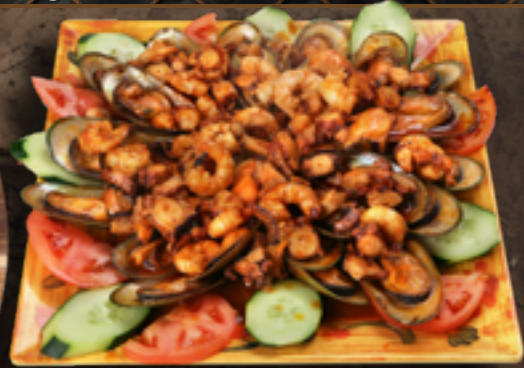
Mejillones Reg 39 95 Preparados 59 95 Mussels Nayarit style. Preparados are served with octopus and shrimp