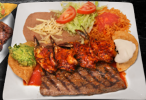
Carne Asada Con Camarones Zarandeados 45 99 Skirt steak with grilled jumbo shrimp in zarandeado sauce