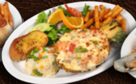
Piña Rellena 28 95 Half pineapple stuffed with seafood and melted cheese