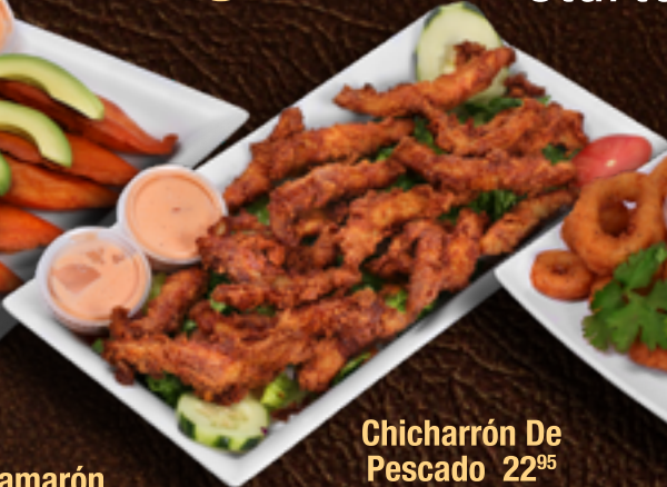
Chicharrón De Pescado 22 95 Fish cracklings