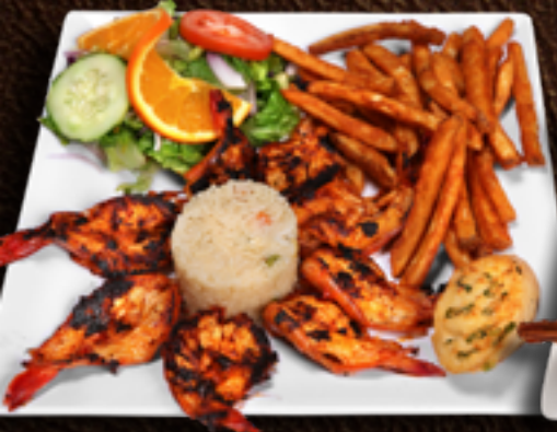
Camarones Zarandeados 29 95 Grilled shrimp in our special "zarandeado" sauce