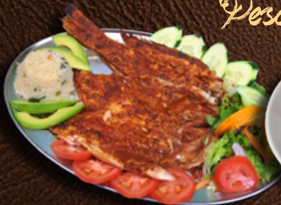
Huachinango Zarandeado MP$ Whole butterflied red snapper grilled in our special Nayarit sauce