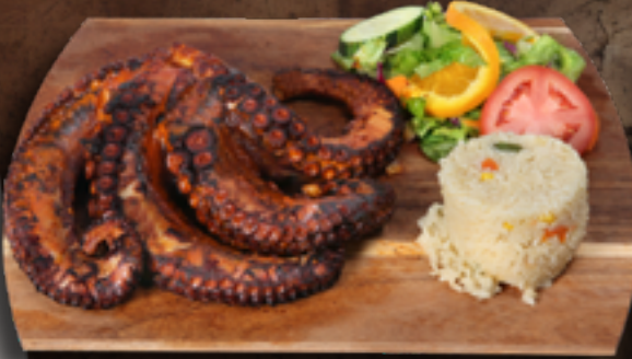
Pulpo Zarandeado 44 95 MP$ Grilled octopus in zarandeado sauce