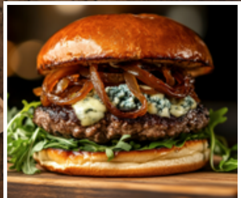
Blue Cheese Chicago Burger 21 99 Beef patty, caramelized onions, arugula, blue cheese. Served with fries