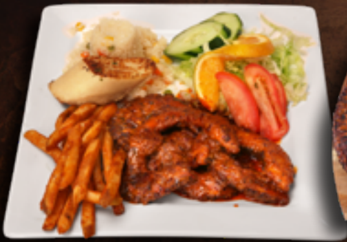
Pulpo Especial 39 95 MP$ Octopus in spicy red sauce