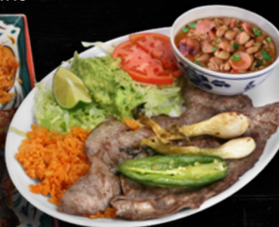
Cecina Estilo Guerrero 24 99 Cured steak