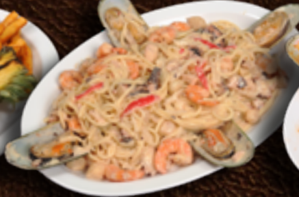
Pasta Con Mariscos 32 95 Alfredo pasta with seafood mix: shrimp, octopus, surimi and mussels