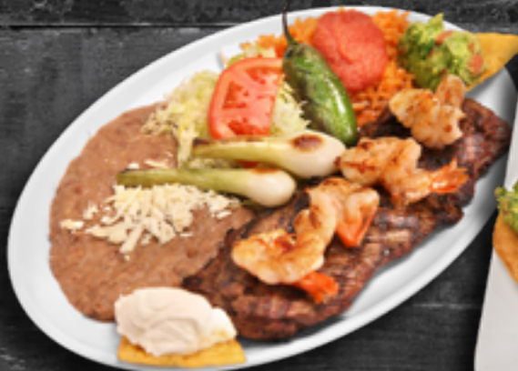
Carne Asada Con Camarones Skirt steak with jumbo shrimp (Pick your style) - Camarones Al Mojo de Ajo in garlic sauce 39 99 - Camarones Al Chipotle Chipotle sauce 39 99 - Camarones Momia Shrimp wrapped in bacon 42 99

Hacienda Los Peña MEXICAN GRILL • SEAFOOD • BAR