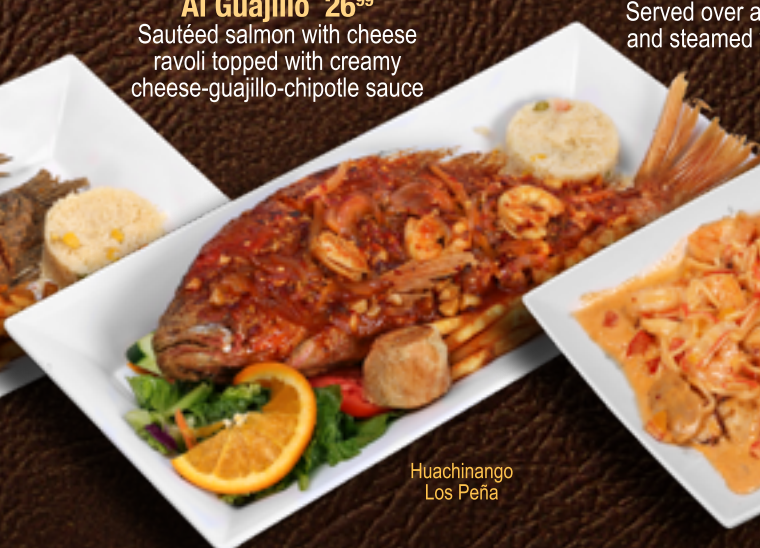
Huachinango Los Peña