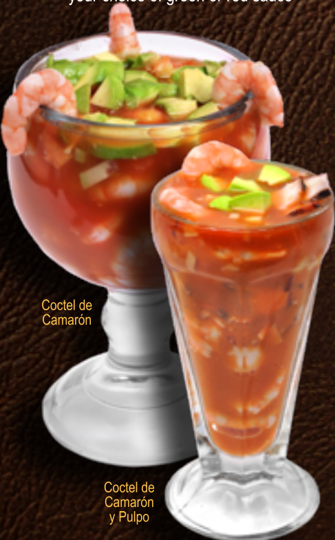
Coctel de Camarón