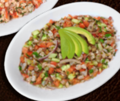
Ceviche de Camarón