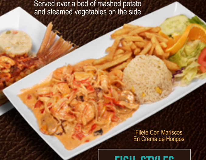
Filete Con Mariscos En Crema de Hongos