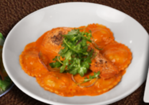
Ravioli Con Salmón Al Guajillo 26 99 Sautéed salmon with cheese ravioli topped with creamy cheese-guajillo-chipotle sauce