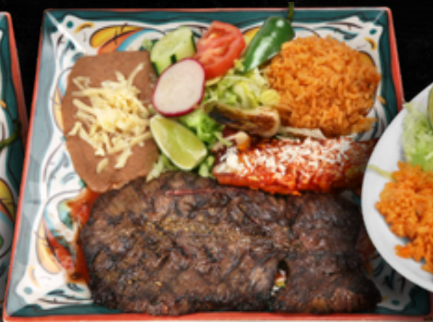
Tampiqueña 39 99 Skirt steak with one cheese enchilada. Your choice: green or red sauce