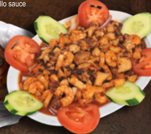
Chapuzón 39 95 Chopped octopus and shrimp Nayarit style