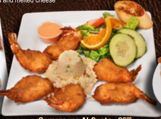
Camarones Al Gusto 25 95 Shrimp cooked to your liking