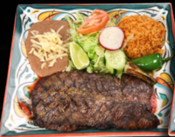
Carne Asada 35 50 Grilled skirt steak