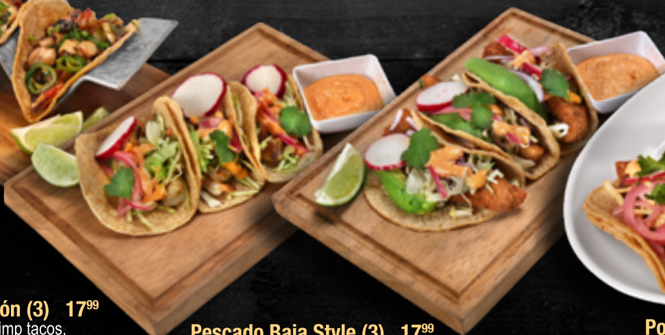
Camarón (3) 17 99 Shrimp tacos, colslaw, chipotle-aioli sauce