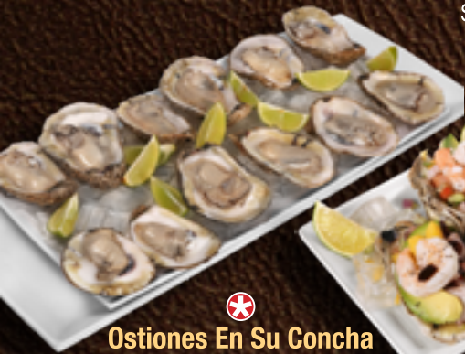
⊕ Ostiones En Su Concha (6) 13 95 (12) 25 95 Raw oysters served in it's half shell