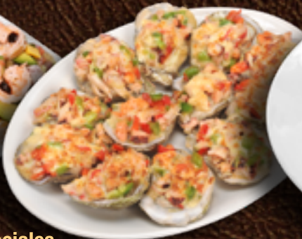
⊕ Ostiones Gratinados (6) 18 95 (12) 35 95 Baked oysters topped with veggies, octopus, shrimp and melted cheese