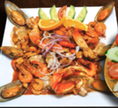
Charola del Mar 49 95 Shrimp, crab legs, mussels, oysters