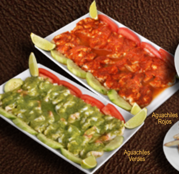
⊕ Aguachiles 22 95 Raw shrimp marinated in lime juice and your choice of green or red sauce