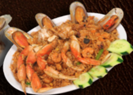
Paella Reg. 32 99 With Crab Leg 42 95 Rice with seafood mix: shrimp, octopus and mussels