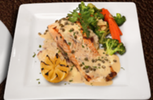
Grilled Salmon With Lemon-Caper Sauce 26 99 Served over a bed of mashed potato and steamed vegetables on the side