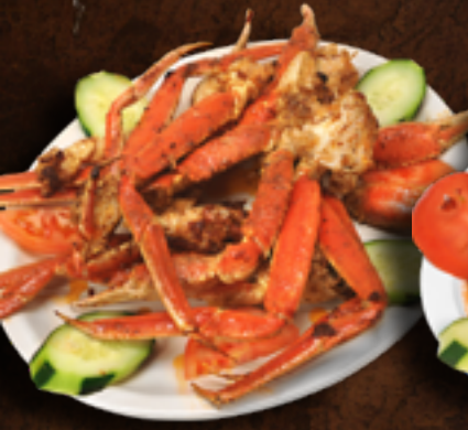
Patas de Jaiba 69 95 Crab legs Nayarit style