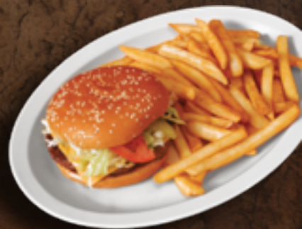
Cheeseburger & Fries