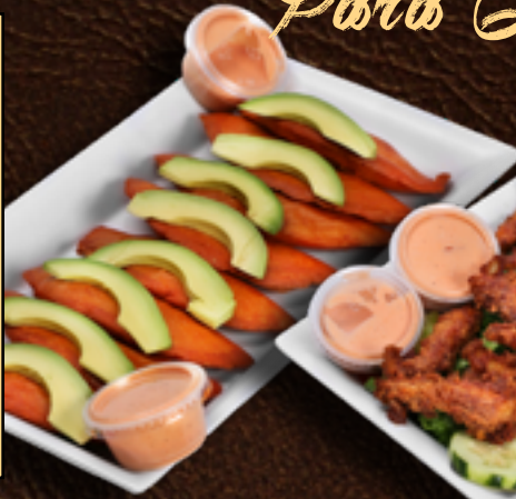
Empanadas De Camarón (4) 14 95 (8) 25 95 Shrimp and cheese empanadas

⊕ THESE ITEMS ARE COOKED TO ORDER CONSUMING RAW OR UNDERCOOKED MEATS, POULTRY, SEAFOOD, SHELLFISH, OR EGGS MAY INCREASE YOUR RISK OF FOODBORNE ILLNESS, ESPECIALLY IF YOU HAVE CERTAIN MEDICAL CONDITIONS ⊕ ESTOS PLATILLOS SON COCINADOS AL TÉRMINO DEL GUSTO DEL CLIENTE CONSUMIR CARNES, AVES, MARISCOS, O HUEVOS CRUDOS O POCO COCIDOS PUEDE AUMENTAR SU RIESGO DE ENFERMEDADES TRANSMITIDAS POR ALIMENTOS, ESPECIALMENTE SI TIENE DETERMINADAS CONDICIONES MÉDICAS