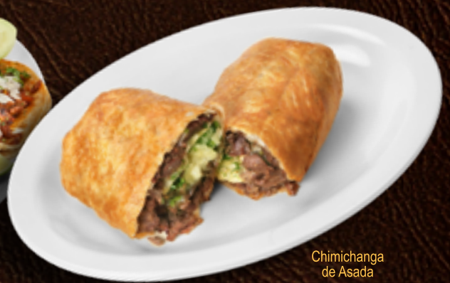
Chimichanga de Asada