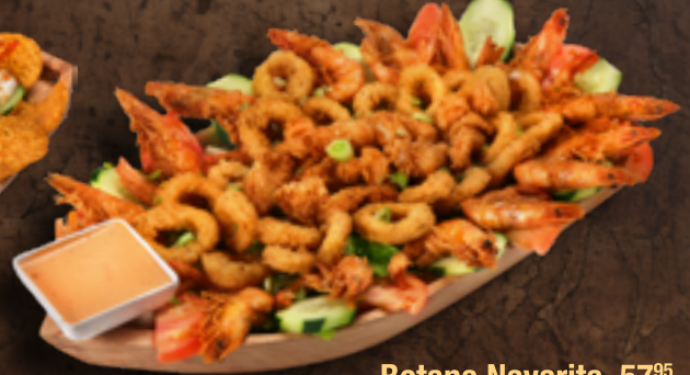
Botana Nayarita 57 95 Fried shrimp, breaded calamari and "chicharrón de pescado" (fried fish chunks) (Serves 2-3)