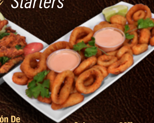
Calamares 20 95 Breaded fried calamari