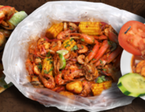
Costalito Hacienda 79 95 Shrimp, crab legs, corn, potato, wieners, mussels, scallops and octopus