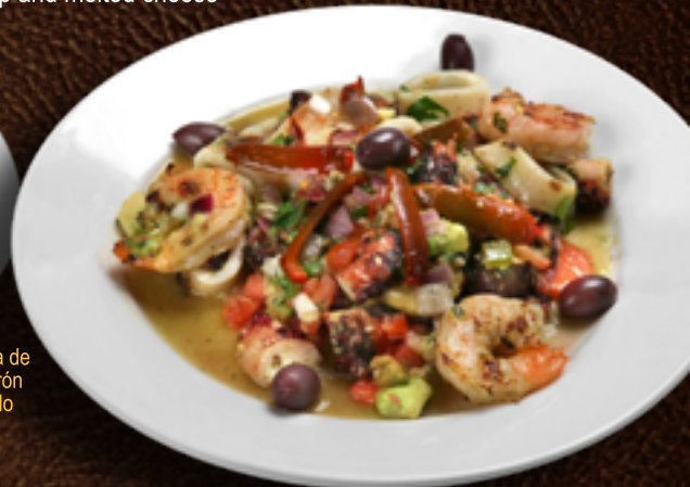
Ceviche Mediterraneo 35 99 Octopus, calamari, shrimp, green olives, jalapeno pepper, Italian dressing, garlic bread