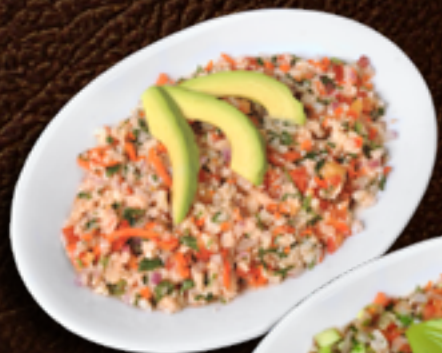
Ceviche de Pescado