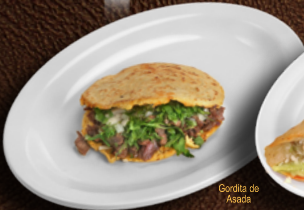
Gordita de Asada