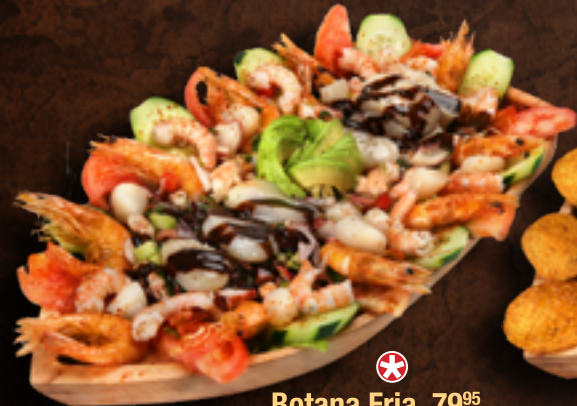
Botana Fria 79 95 Raw scallops, shrimp and octopus (Serves 2-3)