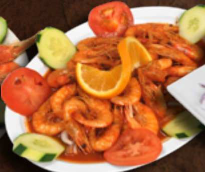
Camarones Cucaracha In The Shell 39 95 Peeled 45 95 Fried shrimp with spicy Huichol sauce