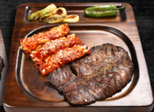
Carne Asada Con Enchiladas 39 99 Skirt steak with cheese enchiladas. Your choice: green or red sauce