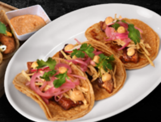
Pork Belly (3) 17 99 Pork belly in our-house tamarind sauce colslaw, pickled red onions, chipotle-aioli sauce