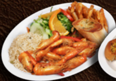
Langostinos 30 95 Prawns Nayarit style