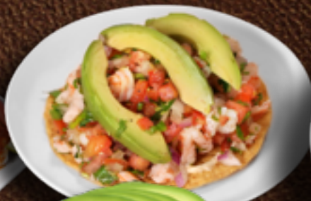
Tostada de Camarón Cocido