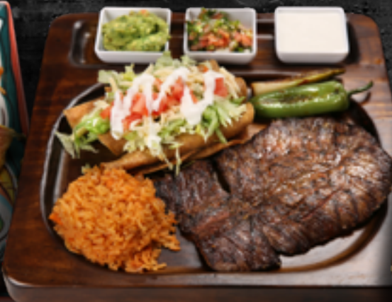
Carne Asada Con Flautas 39 99 Skirt steak with chicken flautas