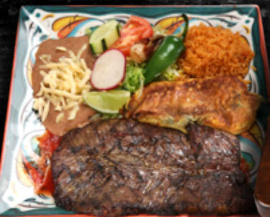
Carne Asada Con Chile Relleno 39 99 Skirt steak with cheese stuffed poblano pepper