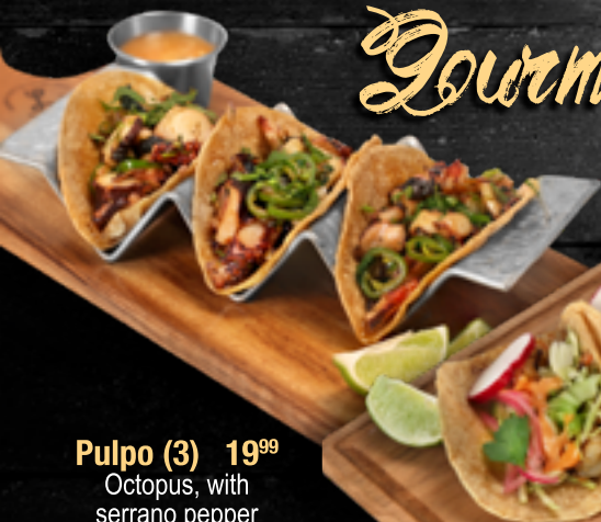
Pulpo (3) 19 99 Octopus, with serrano pepper