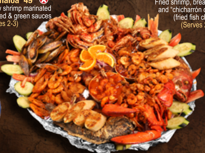
La Delicia De Los Peña Serves 8 to 10 people MP$ Crab legs, whole lobster, whole red snapper, whole tilapia fish, breaded shrimp, shrimp wrapped in bacon, shrimp spicy cucaracha style, prawns, mussels, chapuzón, shrimp in spicy deviled sauce, rice, garlic bread, and fries