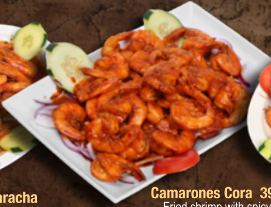
Camarones Cora 39 95 Fried shrimp with spicy guajillo sauce