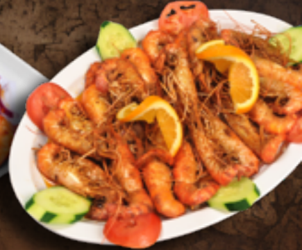
Langostinos 39 95 Prawns Nayarit style