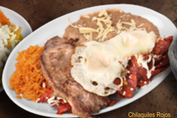
Chilaquiles Rojos Con Cecina Y Huevos